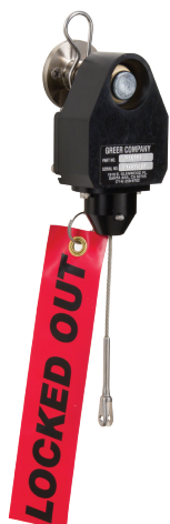
Anti-Two Block Switch Kits