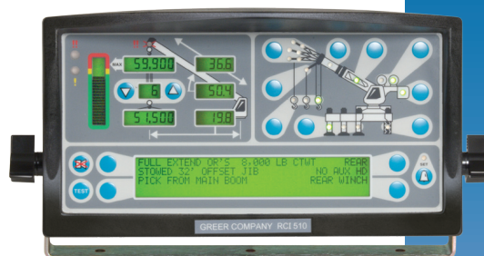
Model 510 For rough terrain, all-terrain and truck crane applications