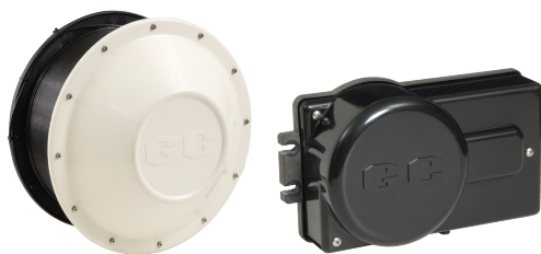
Reeling Drums with Boom Angle and Length Sensors